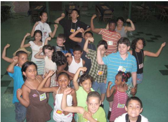
We had about 100 kids at this year's Vacation Bible School, where kids learned that "God is Strong!"

You may have wondered and thought that I was missing in action, as I have not written for a while. No, I was over my head in ministry! My faith, and my family's, has been tried and tested these past four years. I did not know if we would make it through alive (figuratively speaking). I am here to tell you that God is faithful to his Word and to the ministry He has privileged us to do and has entrusted us with. By his grace and mercy, He has surely strengthened us. We are giving all the praise to Him, for He has blessed us with physical, spiritual, and emotional strength. Who ever said that making fruitful, faithful followers of Jesus Christ was going to be easy or cheap? Yet that is the command of our Lord and Savior Jesus Christ, that we make disciples. That is what we are busy about in the ministry.