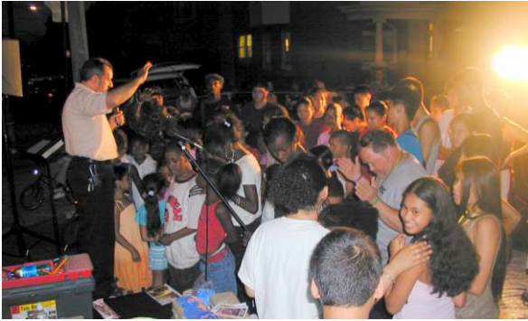
An open-air meeting at our local recreation center.